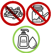
Use gentle, non-irritating hydrating skin cleansers