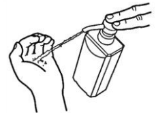
Apply moisturizer to all affected areas