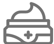
Use a non-irritating, fragrance-free moisturizer